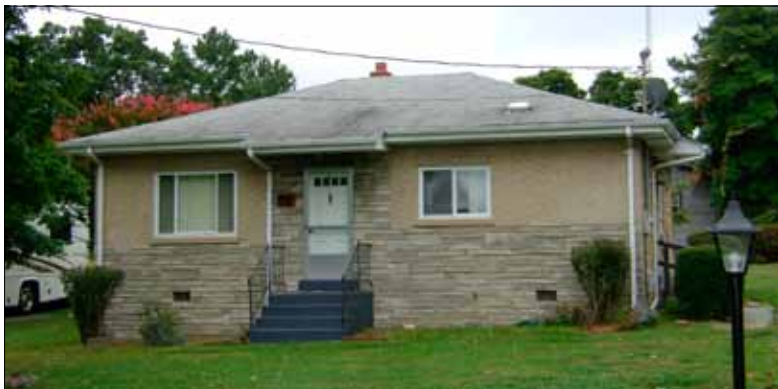
NICE 2 BEDROOM, 1 BATH HOME in the heart of Gretna. This home offers 850 square feet of living space, replacement windows, hardwood floors, lots of cabinet space in the kitchen. Nice size rooms. Paved drive, and 2 storage buildings. 1/3 acre lot.

DIRECTIONS: From Main Street, Gretna turn onto Henry Street, go 6 blocks, turn right onto Gay Street.